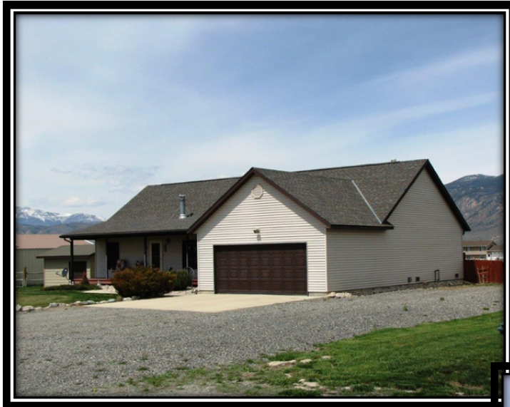
Southfork Home In the Shadow of Carter Mountain