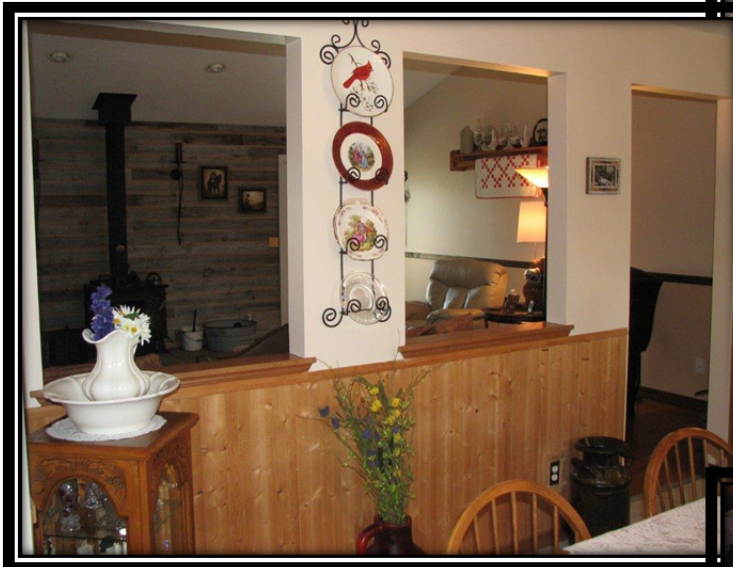
Dining Area Looking into Living Room