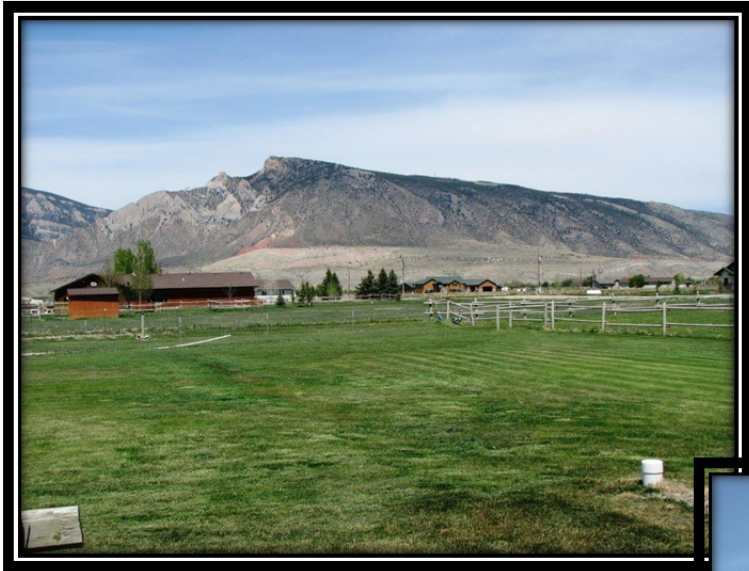
Back Yard Views