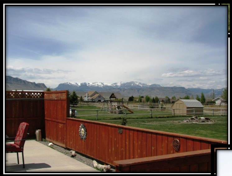
Back Yard Views