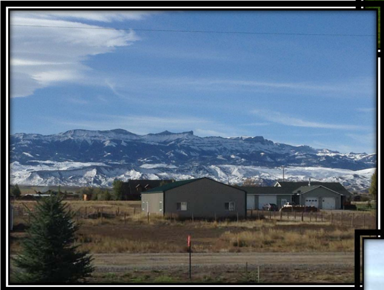
Carter Mountain From the Front Porch